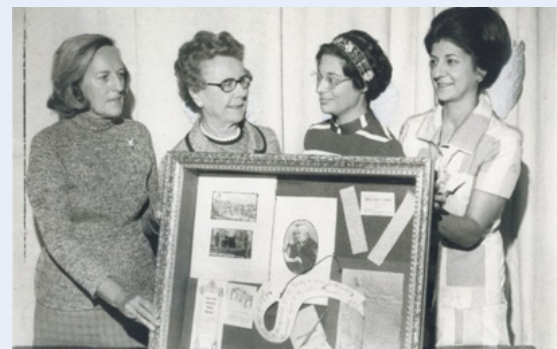
From top, Alice Paul announcing the Equal Rights Amendment in Seneca Falls; the Hall's current gallery features introductory exhibits; four founding members of the Hall imagined a permanent home for women's achievements.