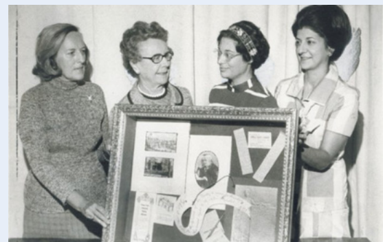
From top, Alice Paul announcing the Equal Rights Amendment in Seneca Falls; the Hall's current gallery features introductory exhibits; four founding members of the Hall imagined a permanent home for women's achievements.