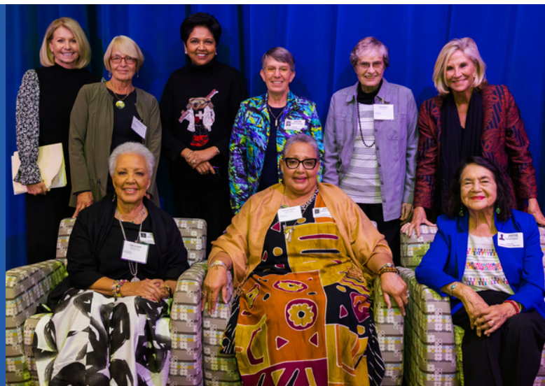
Inductees and their family members gather after a program for high schoolers from across New York State.